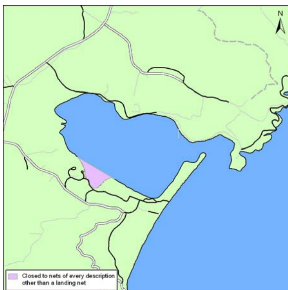
Figure 3. Wallagoot Lake

Wallagoot Lake (Figure 3). The following waters are closed to nets of every description other than a landing net: all waters between and to the south west of the line between point A (149.931, -36.790) to point B (149.936, -36.793). Latitude and longitude coordinates are in GDA94 datum.