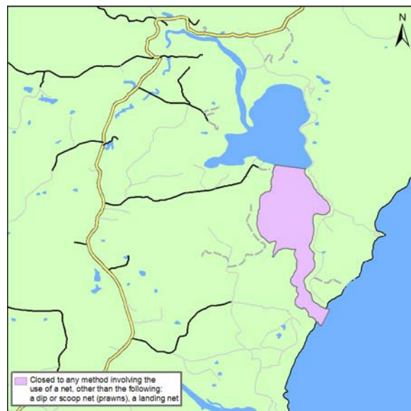
Figure 1. Wapengo Lake

Sandy Beach Creek and Bournda Lagoon. The following waters are closed to any method involving the use of a net, other than a dip or scoop net (prawns), or a landing net: the whole of the waters of Sandy Beach Creek and Bournda Lagoon, together with all their inlets, creeks and tributaries.